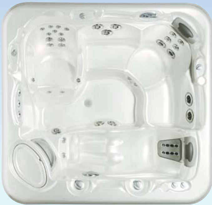
Envoy spa shell shown in Pearl